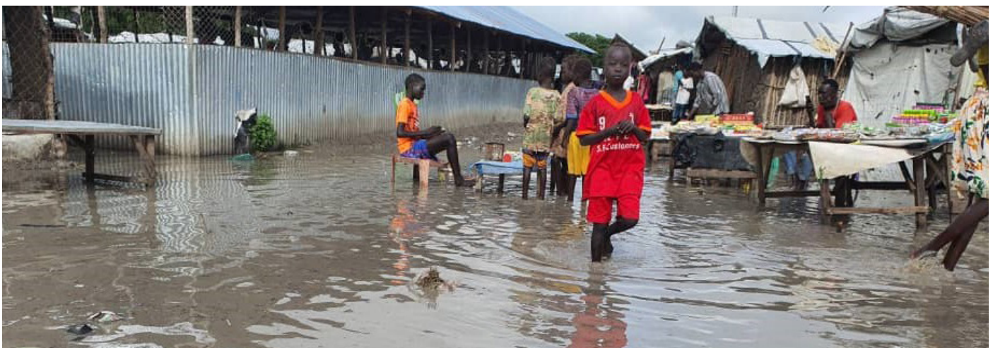
Photo showing the flood situation in Nyirol County, Jonglei State, South Sudan

For a country already dealing with existing man-made crises and outbreaks, this recurrent and severe flooding has compounded existing humanitarian crises, pushing vulnerable communities to the edge and plunging the country further into economic crisis. The immediate response so far, led by humanitarian organisations like IMC and UN agencies, has addressed critical health, nutrition, and psychosocial support needs to the best of their collective capacities. However, persistent gaps in aid due to access challenges, like impassable roads and overwhelmed facilities, highlight the pressing need for sustainable infrastructure improvements. Progressively, scaling up preventative measures like dyke construction, enhancing transport logistics, and more hands on the ground to support healthcare services will be essential to prevent further displacement, manage disease outbreaks, and support affected communities in rebuilding their lives.